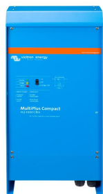
MultiPlus Compact 12/2000/80

And sophisticated software (VE.Bus Quick Configure and VE.Bus System Configurator) is available to configure several new, advanced, features.